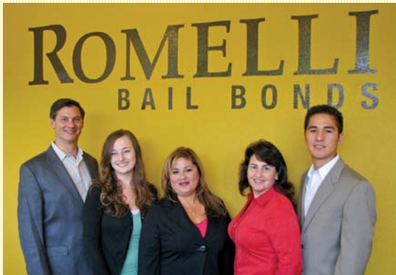
FRIENDLY STAFF HERE WHEN YOU NEED US